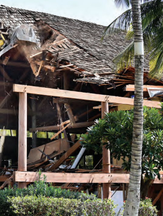
Demolition of former Aston Maui Lu

Maalaea Bay, the new HGVC timeshare will be Hilton's first on Maui. Honolulu-based Kuponon Partners LLC and development manager Capbridge Pacific LLC plan to complete the project in two or three phases, with Phase I slated to open in 2017.